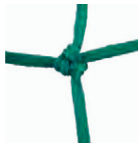
PE braided 3 mm single mesh - GREEN