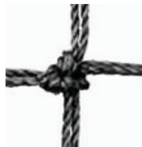
PE twisted 2 mm double mesh