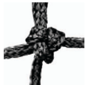
PE braided 4 mm single mesh