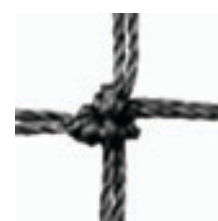
PE twisted 2 mm double mesh