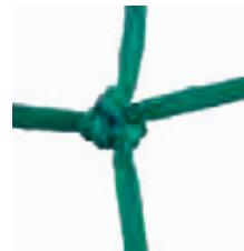
PE braided 3 mm single mesh