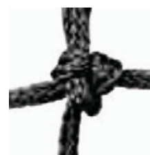
PE braided 4 mm single mesh