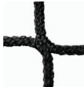
Mesh 120 mm without knots