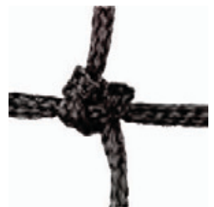
PE braided 3 mm single mesh