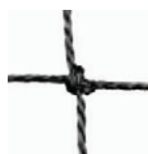
PE twisted 2 mm single mesh