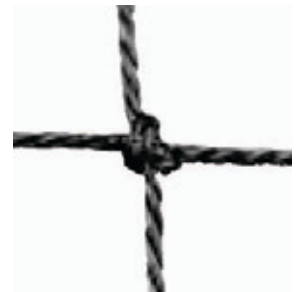
PE twisted 2 mm single mesh